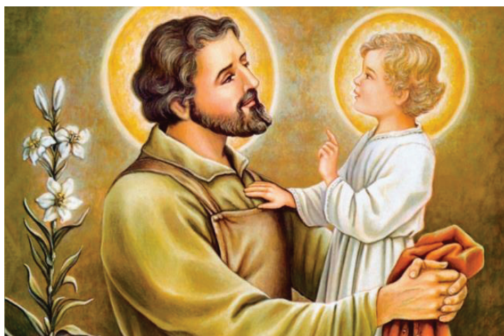
Matthew 1:18-24 • Joseph Accepts Jesus as His Son

On the Fourth Sunday of Advent , we read in Matthew's Gospel about Joseph and his decision to divorce the pregnant Mary. An angel comes to Joseph: "Do not be afraid to take Mary your wife into your home. For it is through the Holy Spirit that this child has been conceived in her."